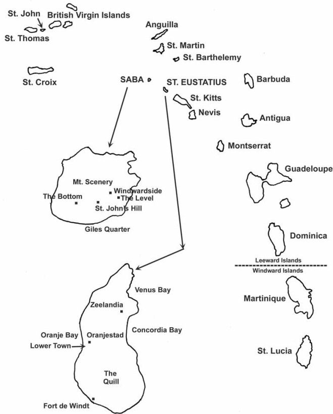
Fig. 1. Northern Lesser Antilles showing the location of St Eustatius and Saba. Insets of the islands illustrate the general collecting areas.

Additional orthopteran specimens, collected primarily in 1949 by Burgers and Hummelinck, were loaned from the Zoölogisch Museum Amsterdam (ZMA). Other specimens were obtained from the Academy of Natural Sciences of Philadelphia (ANSP) and the Zoologisk Museum, Copenhagen (ZMC). Specimens studied are deposited in ANSP, MNHN (Muséum National d'Histoire naturelle, Paris), UMMZ (University of Michigan Museum of Zoology, Ann Arbor), ZMA, and ZMC.